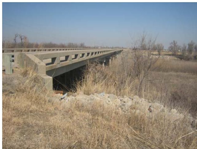
Bridge on Hydraulic over Wichita Valley Center Flood Control Project scheduled for replacement

The Division of Public Works constantly monitors traffic on arterial streets and at intersections. The priority of various CIP projects is adjusted according to this changing traffic information. Equally important, on a five year rotating schedule, each mile of county roads receives an appropriate maintenance treatment based on its condition. The CIP also continues an aggressive replacement program for bridges with posted weight limits. The County continues to support efforts to obtain state project funding to address other issues identified in the 2030 plan, such as the freeway system and crossings over the floodway. Examples include: