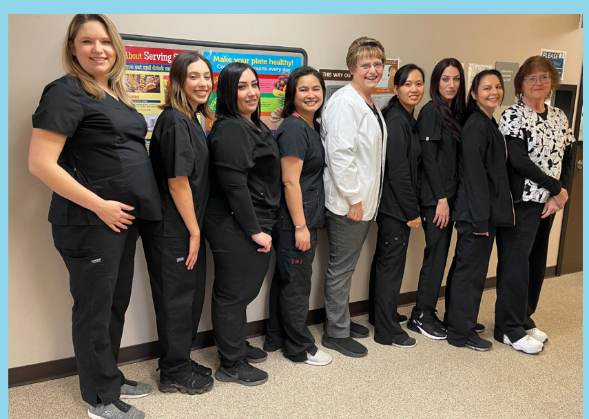
General Clinic staff