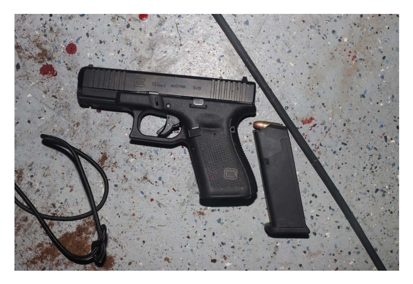
Photo of the 9 mm handgun located next to Mr. Banuelos in the garage.