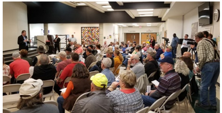
Community members listen to presentation during the second public meeting